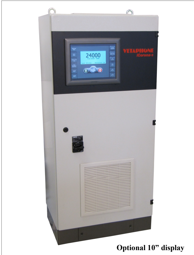
Optional 10" display